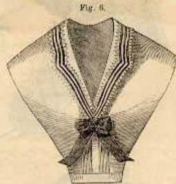
Fig. 6.—Fancy collar.

Fig. 5.—Fancy muslin undersleeve, trimmed with ribbons and velvet.